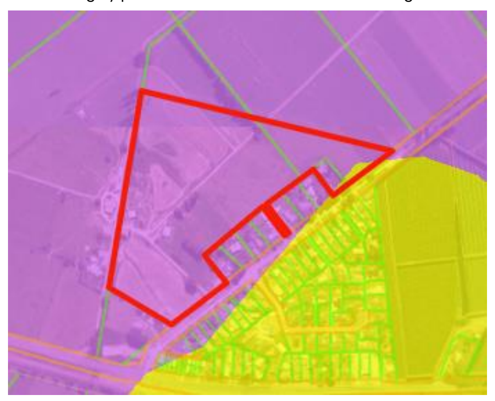
Figure 3: Map showing Highly Productive Land on the plan change site. Purple is Class 2 and yellow is class 3 soil.