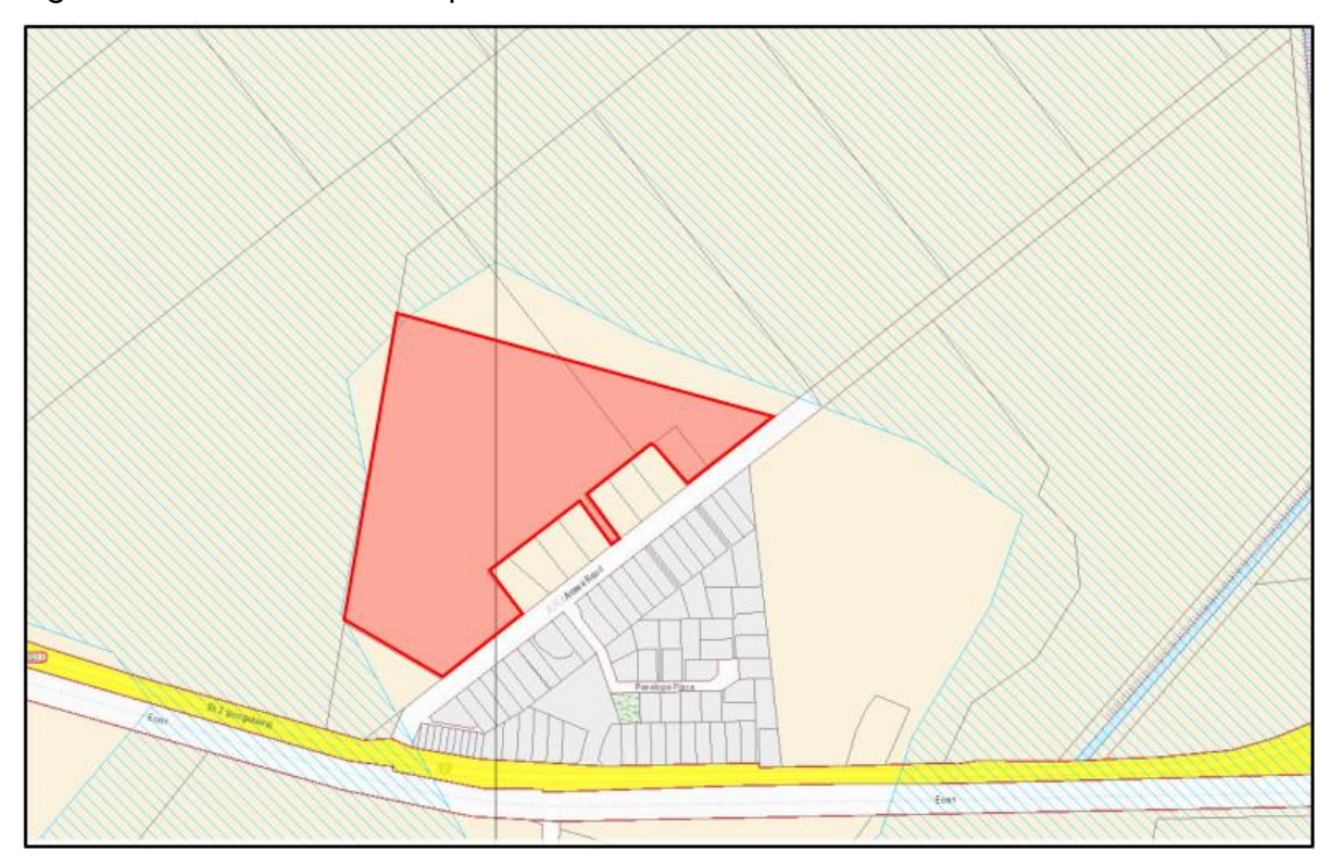
Figure 2: Proposed Plan Change area shown in red with current District Plan zoning context. Rural zone is beige, residential is grey and blue dash is floodable overlay.

13. The site is located primarily on land within the farm property of 1491 State Highway 2 (SH2), Pongakawa. The larger dairy farm land holding of 76.7ha has frontage to both SH2 and Arawa Road. The site is a working dairy farm and contains a primary dwelling, two ancillary sheds in the south western area of the property. A milking