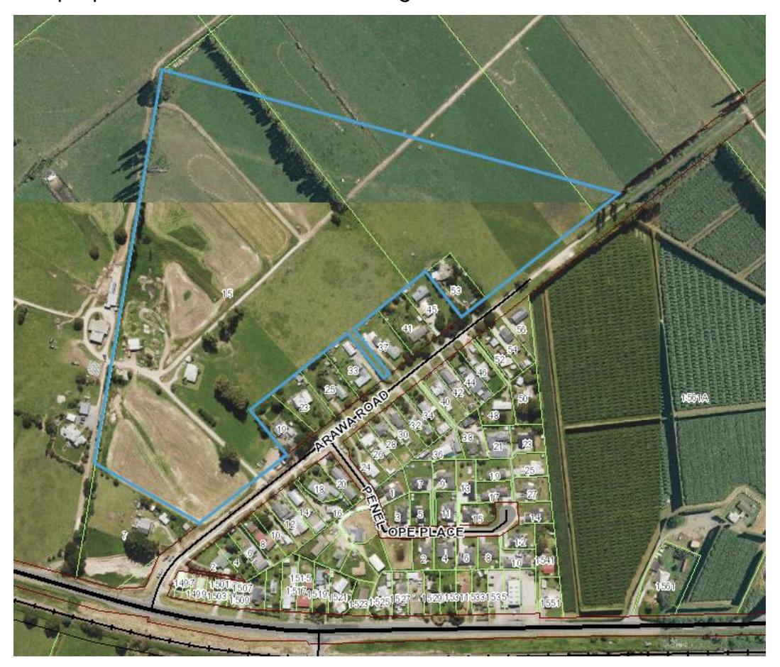
Figure 1: Aerial photo and structure plan area shown in blue outline.

4. The proposed PPC area is shown in Figure 1 below: